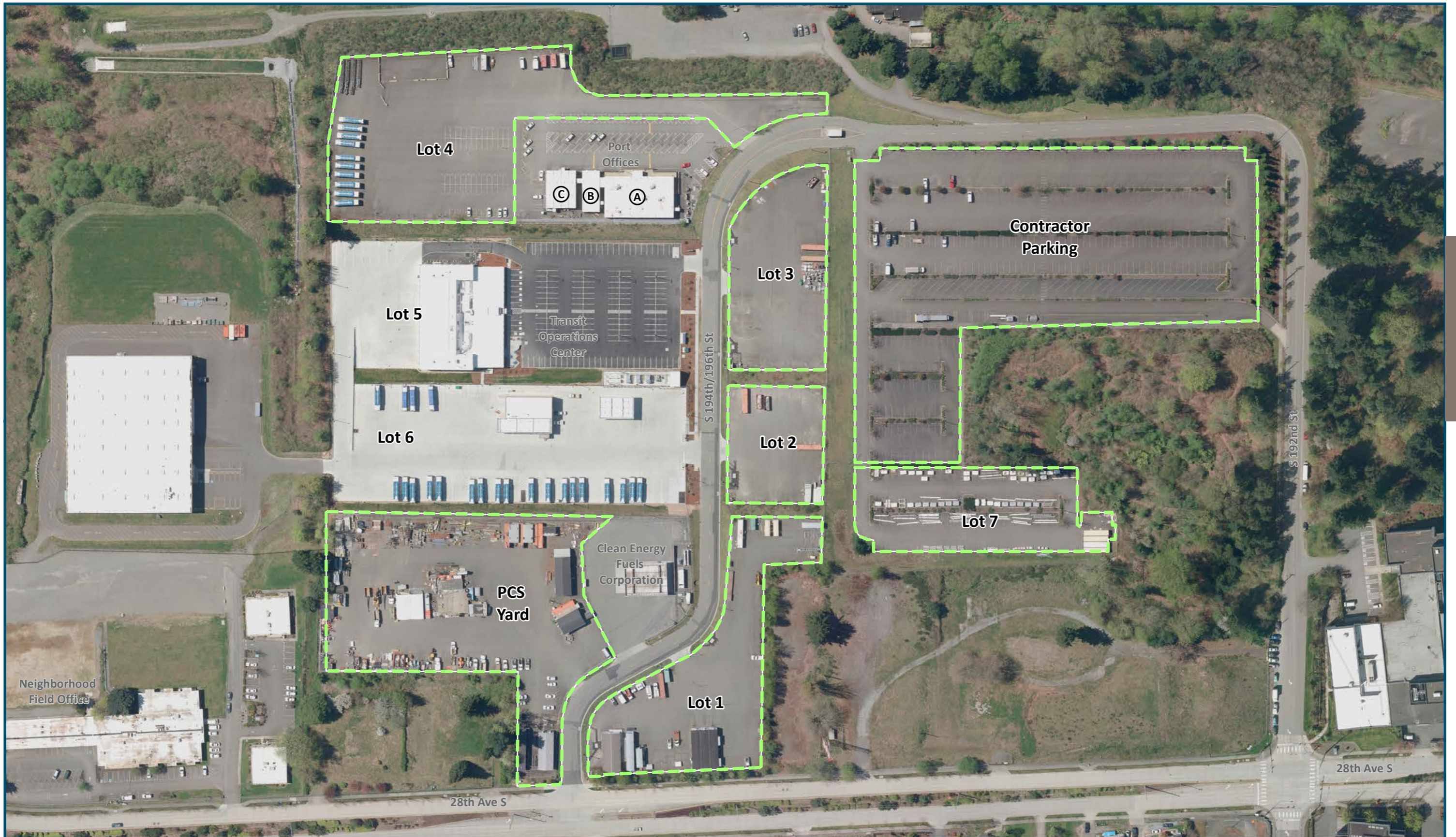
Aerial Photo Taken Spring 2012